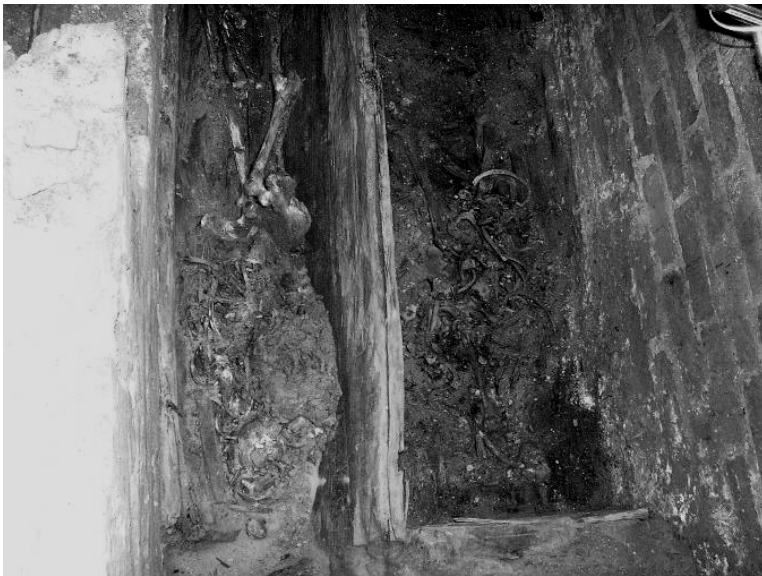
Grand Masters and wooden coffins in their crypt.