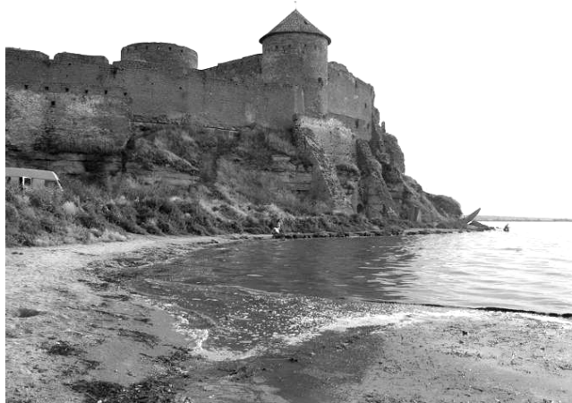
Tomasz sampling, and a view of part of the enormous fortifications. For more information on the project and views of the site, see http://www.akkermanfortress.org .