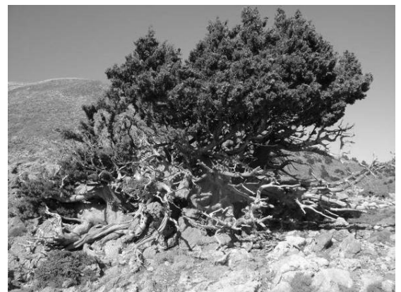
Ancient Cypress tree, White Mountains, Crete.

In collaboration again with Jennifer Moody and Oliver Rackham, Tomasz and Sturt returned to Crete to further examine the Cypress trees of the White Mountains. These extraordinary trees at the upper timberline may well be among the oldest in Europe. The downside is they have often very tiny rings, and very individual and often eccentric ring sequences, which makes cross-dating a real challenge. Ring counts indicate some trees to be of 800-1000+ years in age. Tomasz presented a summary of our work at a conference in Athens in September.