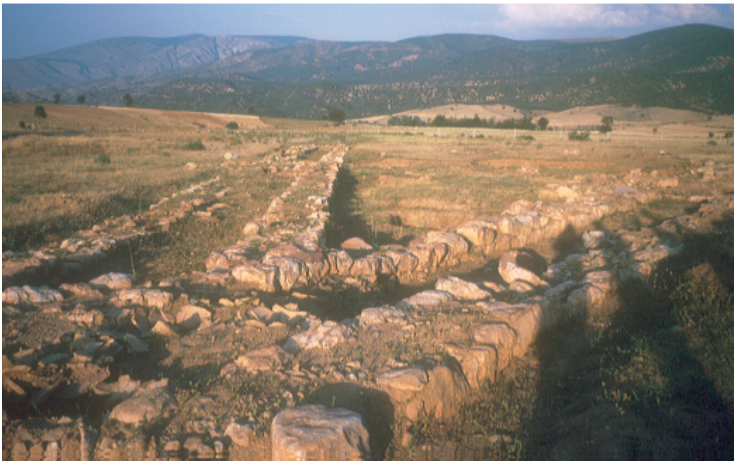
North temenos wall at Ortaköy/Sapinuwa. A 14th century date is likely.