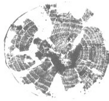
Demircihöyük sample with 12 rings (hopeless for crossdating).